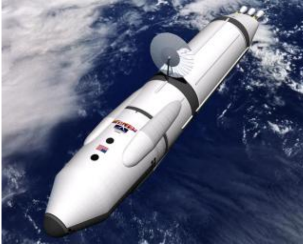
A spacecraft powered by a positron reactor would resemble this artist's concept of the Mars Reference Mission spacecraft.

Most self-respecting starships in science fiction stories use antimatter as fuel for a good reason – it's the most potent fuel known. While tons of chemical fuel are needed to propel a human mission to Mars, just tens of milligrams of antimatter will do (a milligram is about one-thousandth the weight of a piece of the original M&M candy).