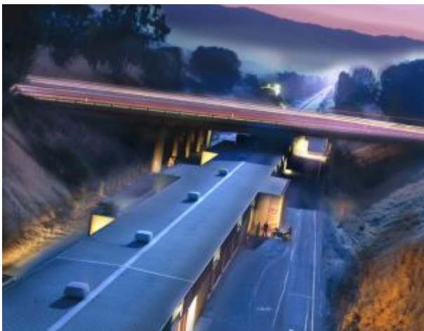
The klystron gallery of the 2-mile long linear accelerator at SLAC. This is the longest building in the world.

B factory experiments at the Stanford Linear Accelerator Center (SLAC) in the USA and at the High Energy Accelerator Research Organization (KEK) in Japan have reached a new milestone in the quest to understand the matter-antimatter imbalance in our universe. These experiments are used by scientists from around the world, including the UK, to probe such fundamental questions.