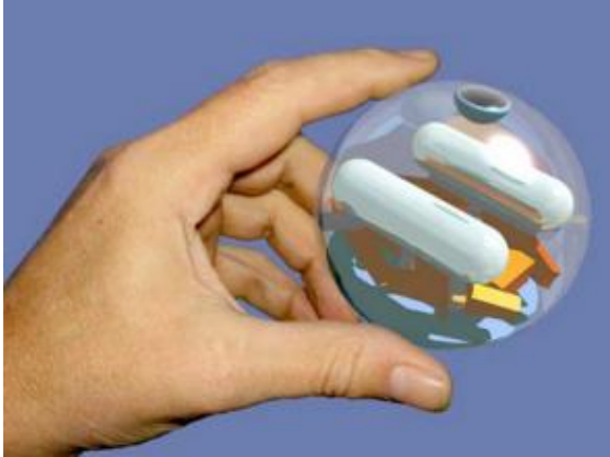
An artist's rendering shows the baseball-sized probes being designed by MIT researchers for Mars exploration. Illustration / Gus Frederick

MIT engineers and scientist colleagues have a new vision for the future of Mars exploration: a swarm of probes, each the size of a baseball, spreading out across the planet in every direction.