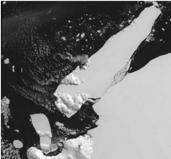
Landsat satellite image of iceberg B15 in January 2001. The iceberg covered about 11,000 square miles, approximately twice the size of Delaware.