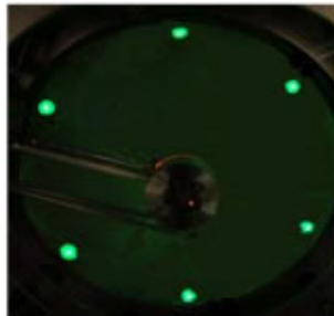
Pt 3 Ni(111)