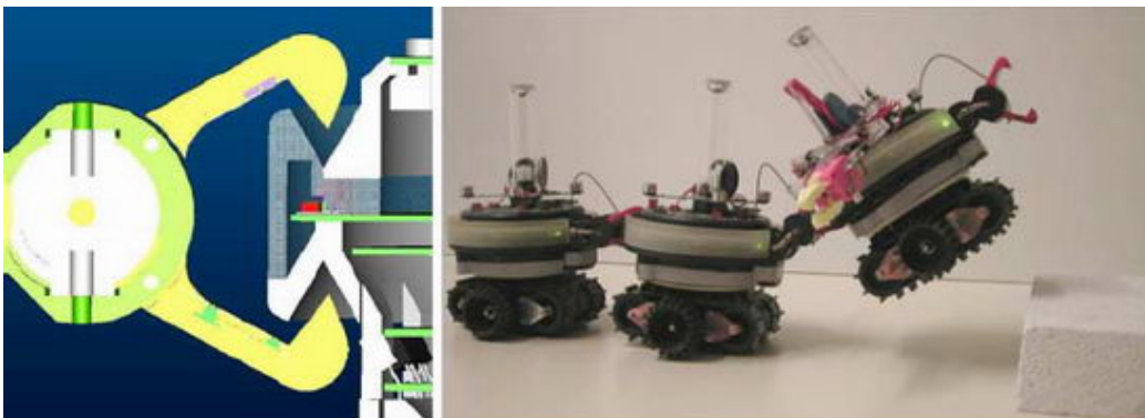
(Left) The rigid gripper used to connect s-bots. (Right) Three s-bots form a swarm-bot that can climb a step. Credit: Groß et al. ©IEEE 2006.

In one of the latest studies on autonomous robots, scientists sat back and watched as their robot created itself out of smaller robotic modules. The result, called “swarm-bot,” comes in many varieties, depending on the assigned task and available components. As the current state of the art in autonomous self-assembly, swarm-bots offer insight into the potential versatility and robustness that robots may possess to perform missions beyond human abilities.