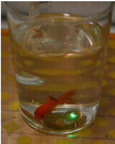
An LED in water, lit by power from the power sheet, poses no danger to a goldfish.

A team of Japanese researchers has created a novel wireless power-transmission device that is thin, flat, and flexible. Based on a sheet of plastic, the device can be put on desks, floors, walls, and almost any other location, delivering power to electronics placed on or near it without the use of cables or connectors.